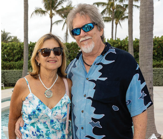
SUMMER 2024 PALM BEACH SOCIETY