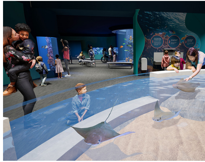
TOP: Gulf Stream; BOTTOM: Touch Tank