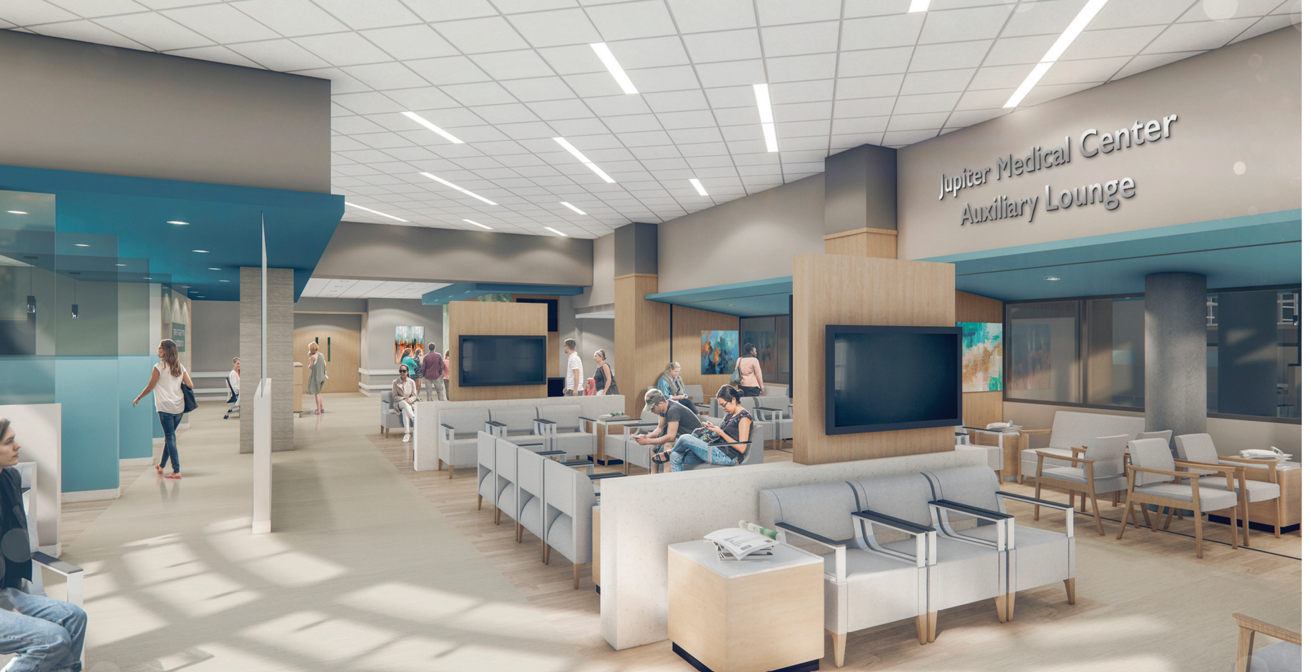
Rendering of the Jupiter Medical Center Auxiliary Lounge