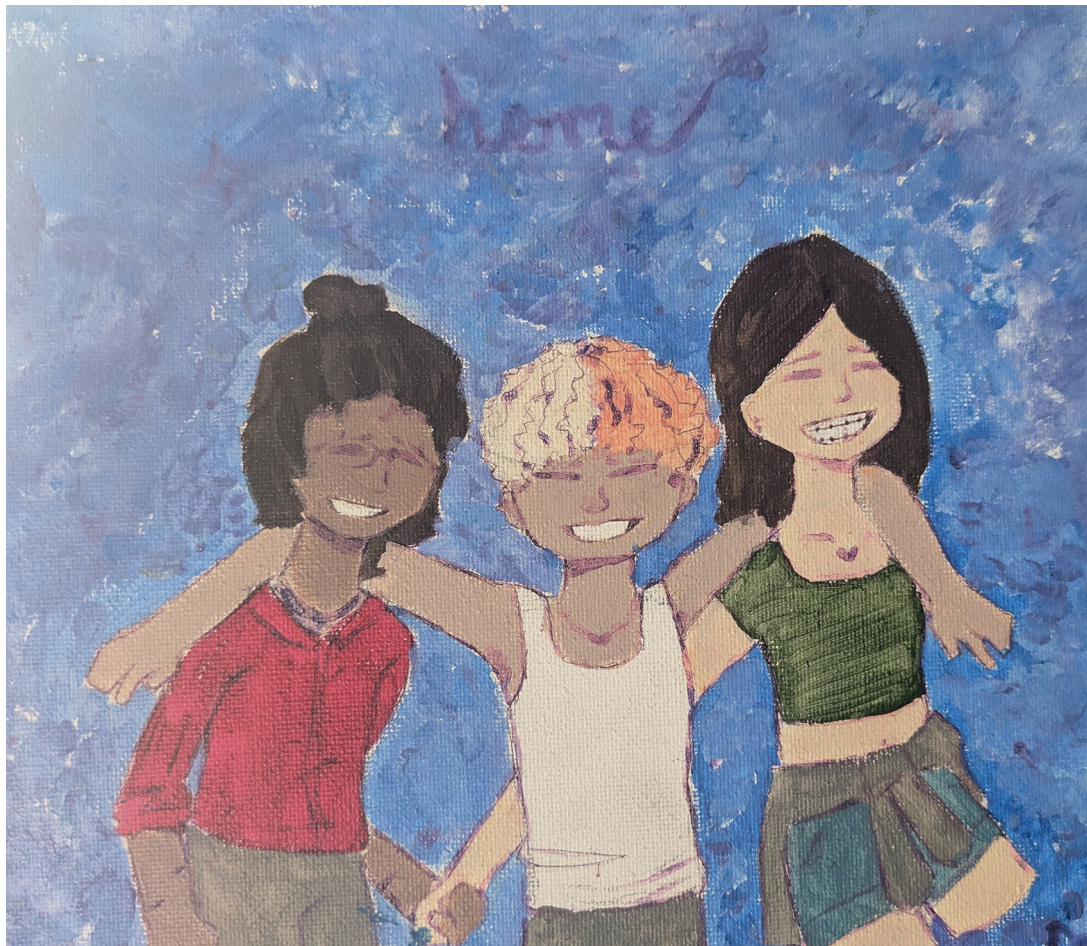
HomeSafe's Art Therapy