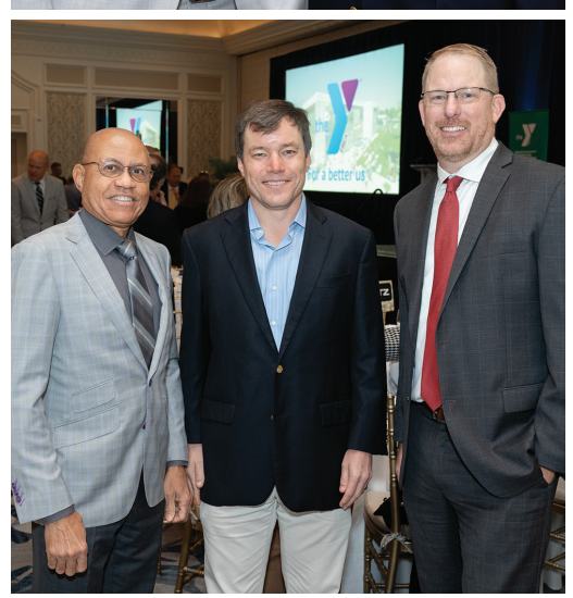
SUMMER 2023 PALM BEACH SOCIETY